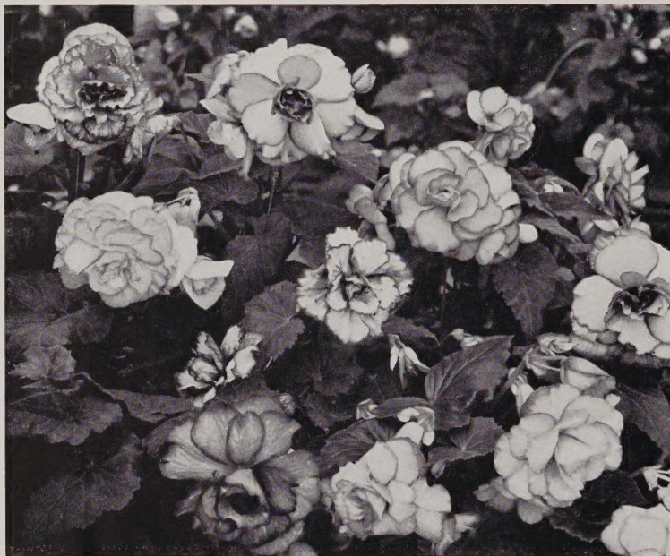
Double Camellia, Picotee Shades

Narcissiflora or Daffodil Flowered . . . This flower resembles a daffodil and is very effective in the collection of begonias as it